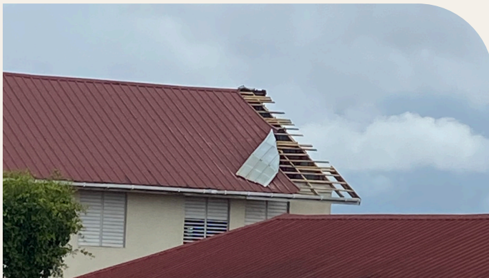
Multiple sites had roof damage