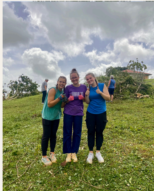
You were there to help!