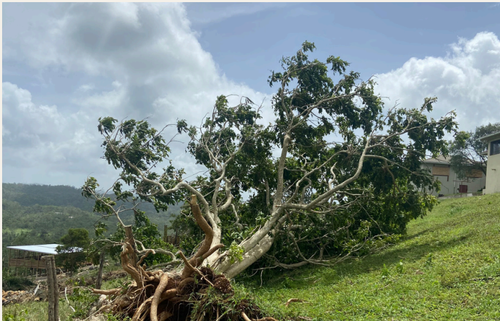
Trees and fences were down

You gave $59,932 to repair campuses after Hurricane Beryl!