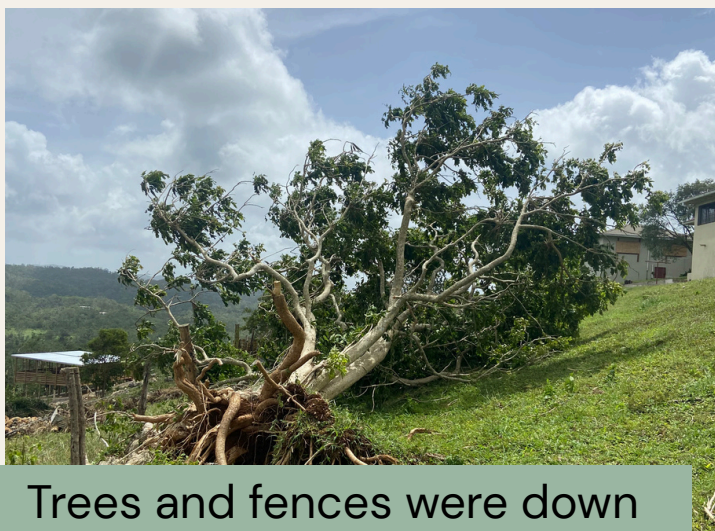
Trees and fences were down

You gave $59,932 to repair campuses after Hurricane Beryl!