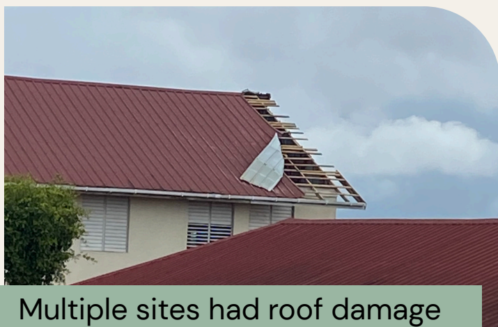
Multiple sites had roof damage