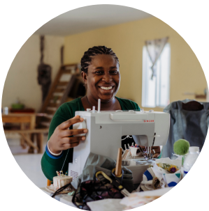
Jamaica Deaf Village Mandeville, JA

By partnering with CCCD, you give the Deaf of Jamaica access to the gospel through education, job-training, skills sharing, evangelism, and Christian community.