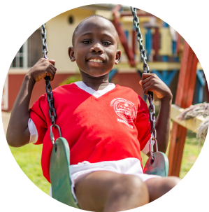
Pre K-12 School Kingston, Jamaica