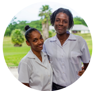
Adult Education Montego Bay, JA