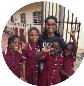
Pre K-12 School Knockpatrick, JA